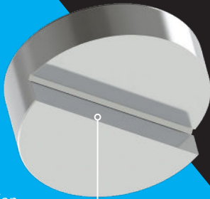
Edge Nest Configuration