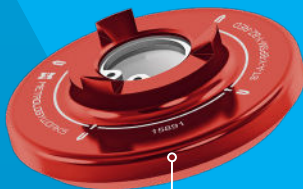
Custom Colors Available