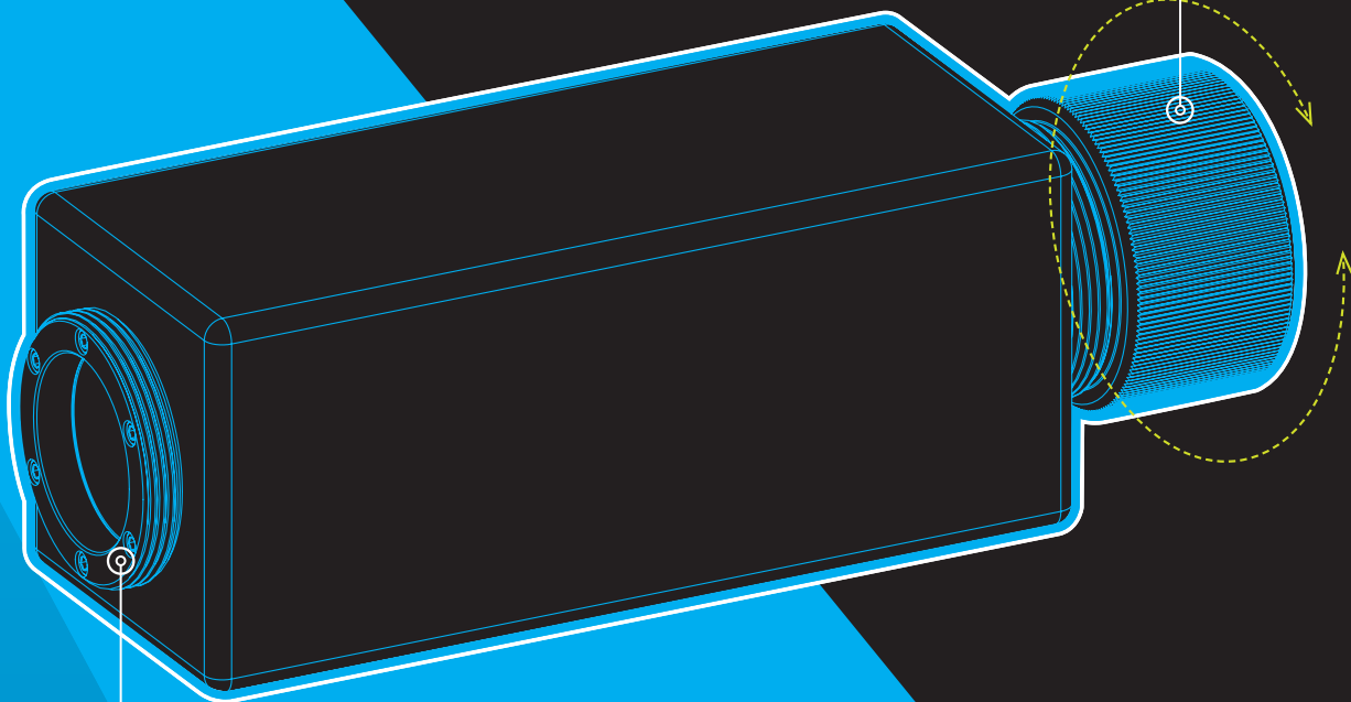
Laser Marked Stainless Steel Ring (3½ - 8 Thread)